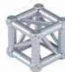
QU25K8 DADO 6 way box corner (8 nodules) K8 is the DADO version for square section structures