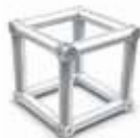
QX25C8 DADO 6 way box corner (8 nodules) C8 is the DADO version for square section structures